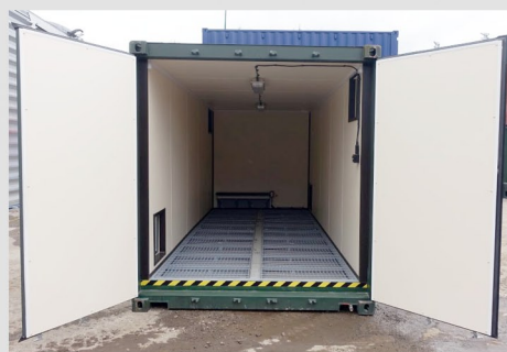
Lined and insulated with electrics

Our COSHH Stores are converted from ISO Shipping Containers similar to our Bunded Chemical Stores but have a sub-floor bund with a raised mesh floor. This avoids personnel having to walk within the contaminated area and a more secure way to deal with hazardous chemicals.