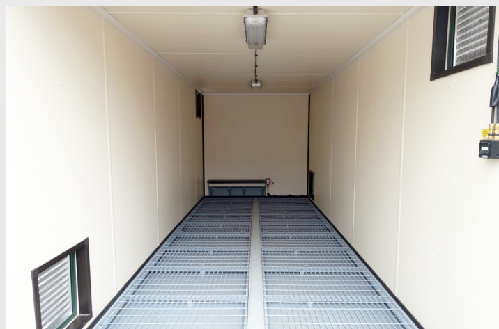
20ft unit, fully lined and insulated with lighting and heating

Zoned electrics and DSEAR certification priced on application, please call for details