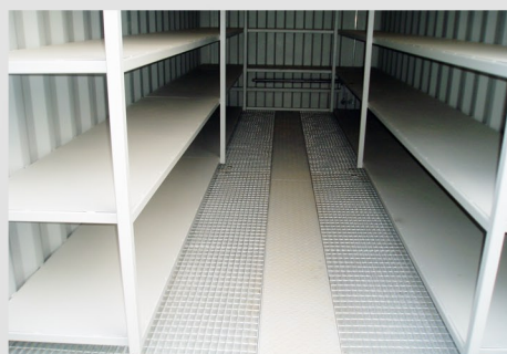
Mesh flooring and shelving