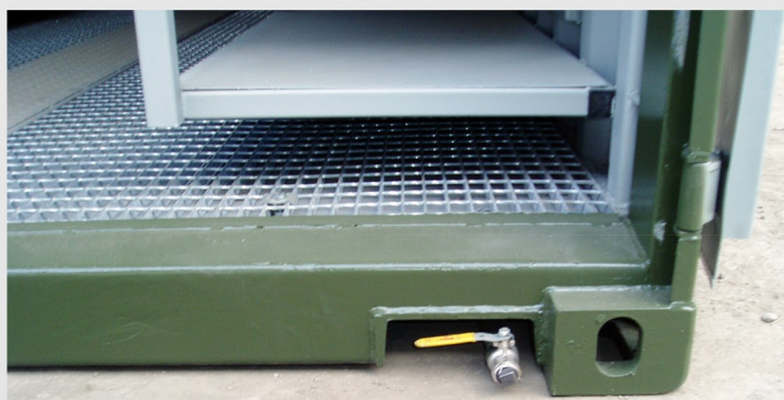
Standard flooring, 3-tier shelving and drainage tap